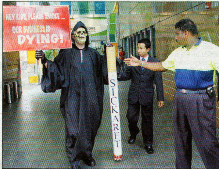
GRIM REAPER MAKES HIS POINT: A protester being asked to leave

the FCTC by allowing such tobacco exhibitions in our country," he said.